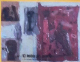
Jivshi Kallat (b.1974)

Jivshi Kallat, born in Mumbai and graduated in Painting from the Sir J.J. School of Art, Mumbai (1996). The artist's works are recognisable for his use of self image working across a variety of media including painting, sculpture, photography and installation. Kallat regularly exploits his immediate urban environment in the city of Mumbai as well as pivotal episodes in history for themes, affording