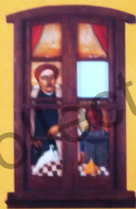
Anjolie Ela Menon (b.1940)