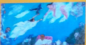
Arpita Singh (b.1937)