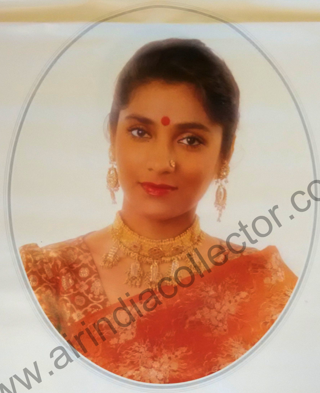
An Uttar Pradesh Woman

Tall and erect, the Uttar Pradesh woman wears a tanchoi saree—a silken brocade weave, recalling the delicacy of Indian miniature paintings, and a kinkhab, silken brocade blouse, both made on handloom. An antique necklace, gulaband, geometrically shaped interlocking plaques made in gold, and earrings, worked in kundan, uncut diamonds and precious stones inlaid in gold, shaped into fish, floral and moon motifs, considered auspicious, and are especially worn on festive occasions.