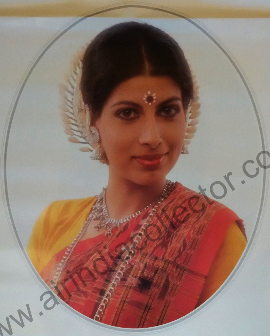
An Orissi Woman

The sarees of Orissa, in silk or cotton are generally hand woven ikat, incorporating bold geometrical patterns in the saree body and traditional fish and floral auspicious motifs in the border, as in this Vicchitrapuri cotton, worn by this bright-eyed young girl. Finely wrought filigreed silver jewellery contrasts with the deep and bright textile colours. Of special interest are the kaan jhumka earrings, which cover the ear and end in a bell-shaped drop.