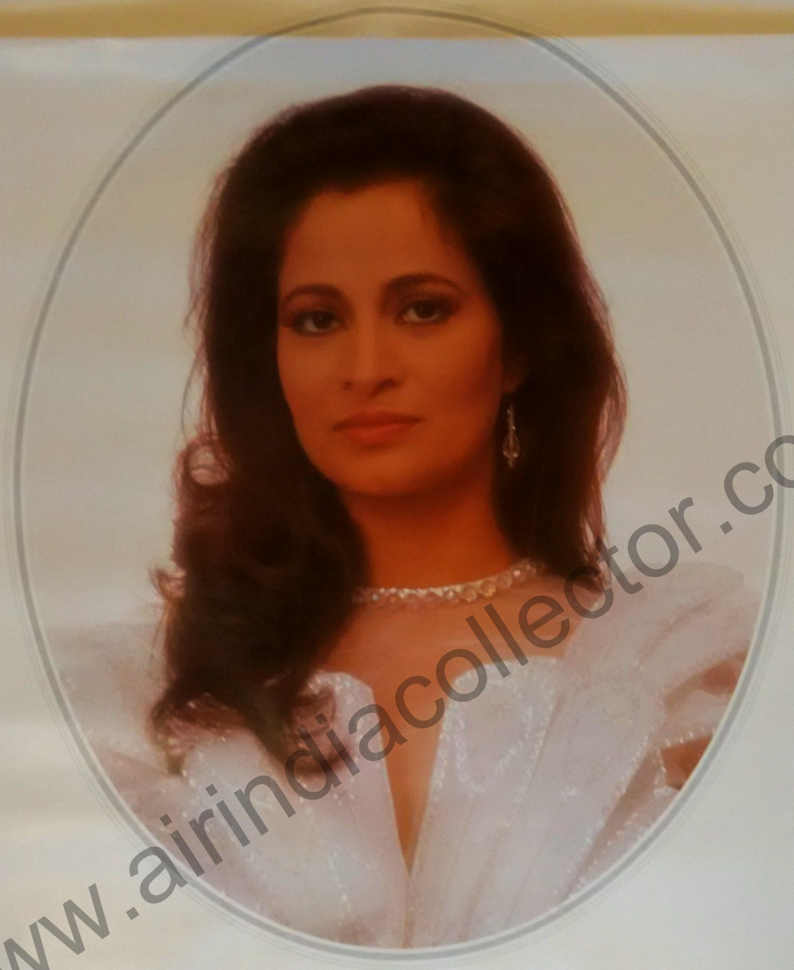
A Goan Woman

This Roman Catholic Goan woman represents one of Goa's predominant communities, the custom and habit of which is inclined towards Western trends. She wears a bridal gown, hand-embroidered in sequins of pearl and Mother-of-pearl, combining with the Western attire, a traditional Indian design representing an expanded peacock's tail.