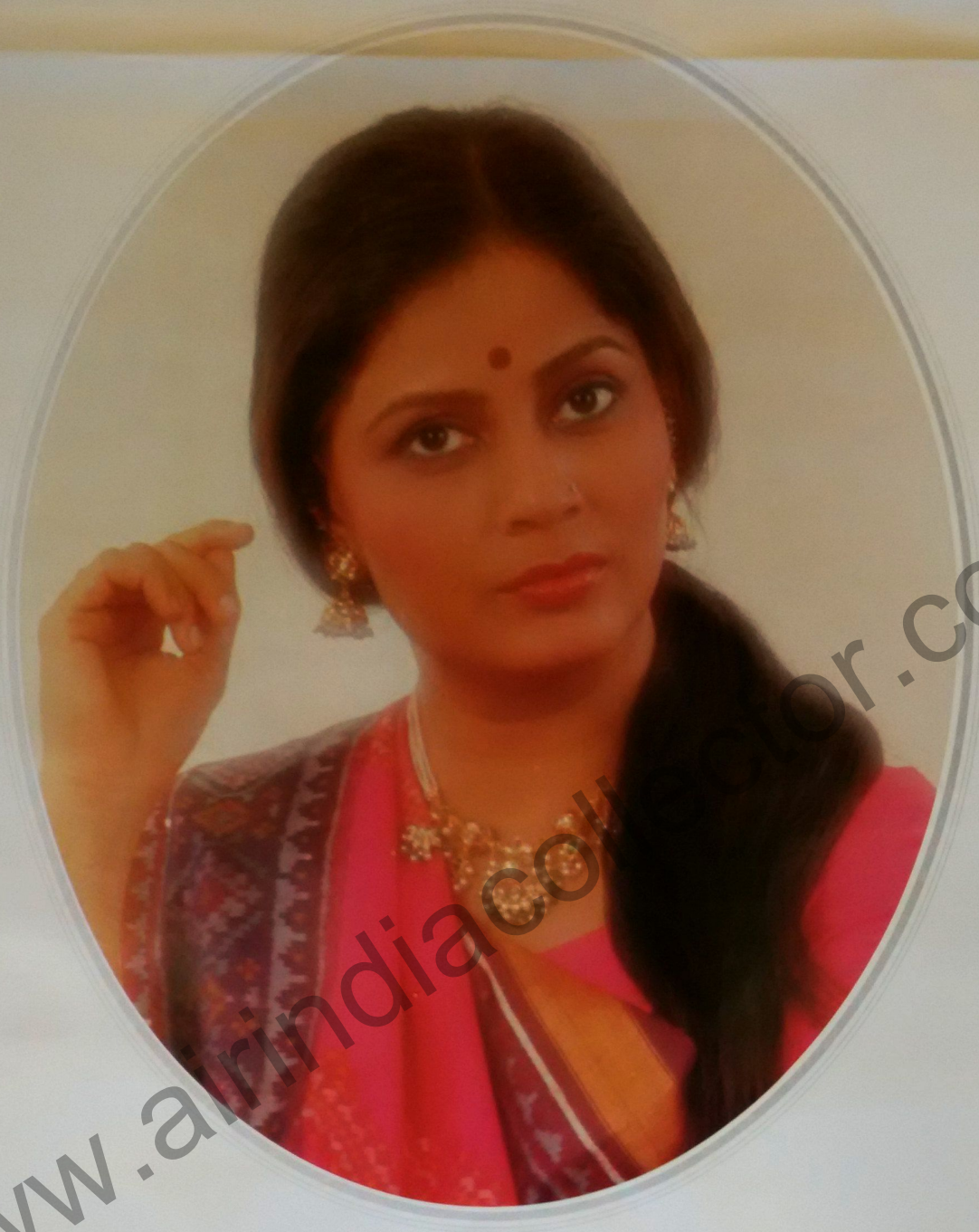
A Gujarati Woman

Wearing a hand-woven dusky pink silk saree with an ikat border, this high-cheekboned Gujarati girl wears a set of traditional ornaments worked in jadu, precious stones set in gold. The necklace consists of jadu pendants interspersed with pearl strands and the earrings are tiny jhumka, or bells, suspended from flower-shaped plaques in diminutive sizes looped over the ear and caught in the carhook. The kara, heavy bangle in the arm is also in jadu.