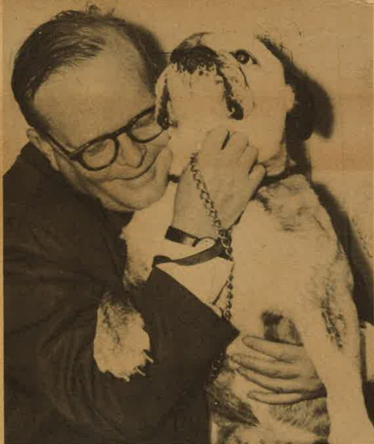
▲ American author, Truman Capote with his bulldog on board our Boeing 707 at London Airport.