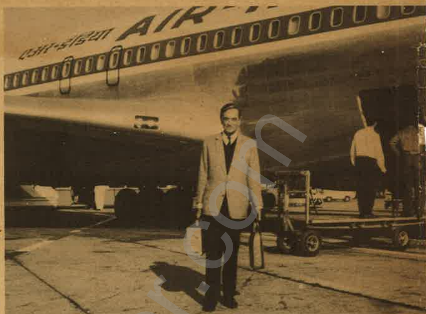
David Lean, Producer of the film "Dr. Zhivago" when he travelled on our service.