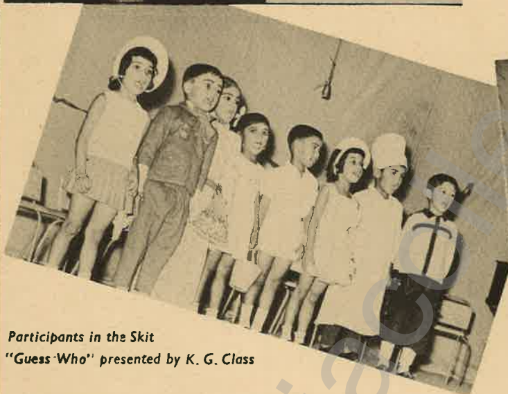
Participants in the Skit "Guess Who" presented by K. G. Class