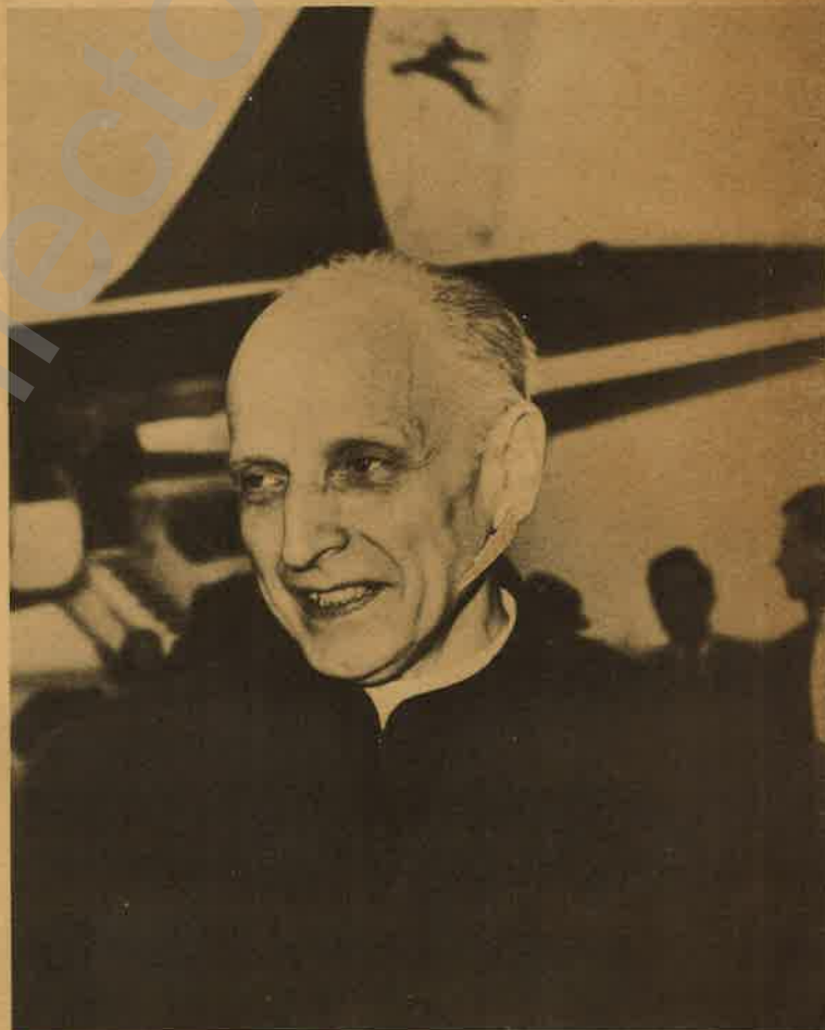
▲ Father Peter Arrupe S.J., the Superior General of the Society of Jesus who travelled to India for the first time.