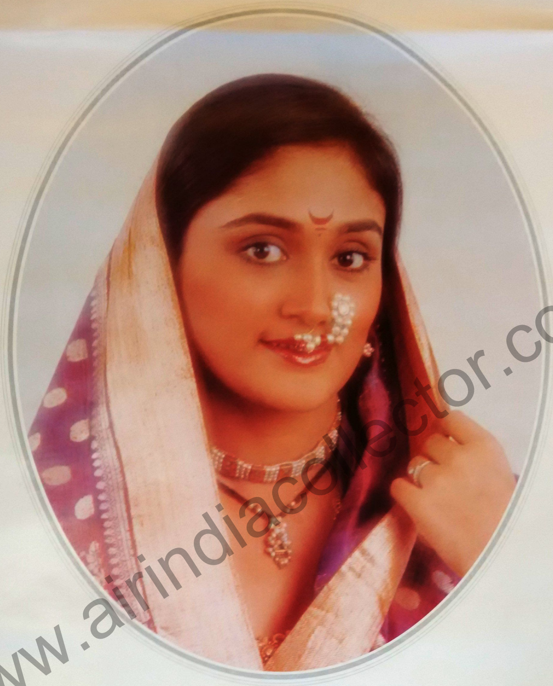
A Maharashtrian Woman

This girl from Maharashtra wears a family heirloom—the patibani sarsa—of a very striking and specialised hand-weave, which had in fact almost died out as a technique but has now been revived with government subsidies. The jewellery consists of a high collar chinch peti, gold squares set in pearl strands; the mangalutra, necklace of black beads with a gold and pearl pendant, and significant of marriage; and the nose ornament, nath, the shape and design of which is typically Maharashtrian and is worn by the bride of each generation.