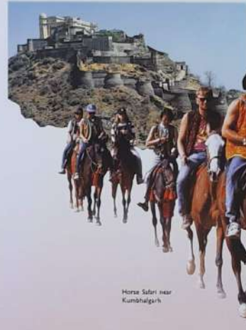
Horse Safari near Kumbhalgarh