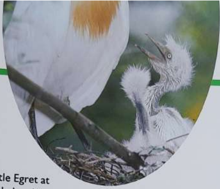
Cattle Egret at Keoladeo National Park, Bharatpur