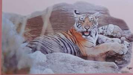
Tiger at Sariska