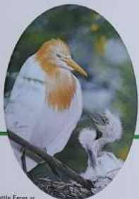
Cattle Egret at Keoladeo National Park, Bharospur