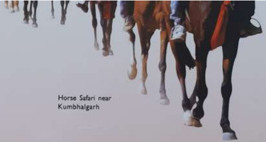
Horse Safari near Kumbhalgarh