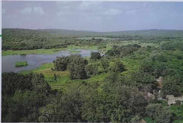
Ranthambhor National Park