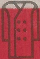
An overcoat wrap or blanket

Articles which may be carried free in addition to the free baggage allowance