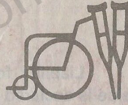
A fully collapsible invalid's wheelchair and/or a pair of crutches and/or braces or other prosthetic device for the passenger's use provided that the passenger is dependent upon them.