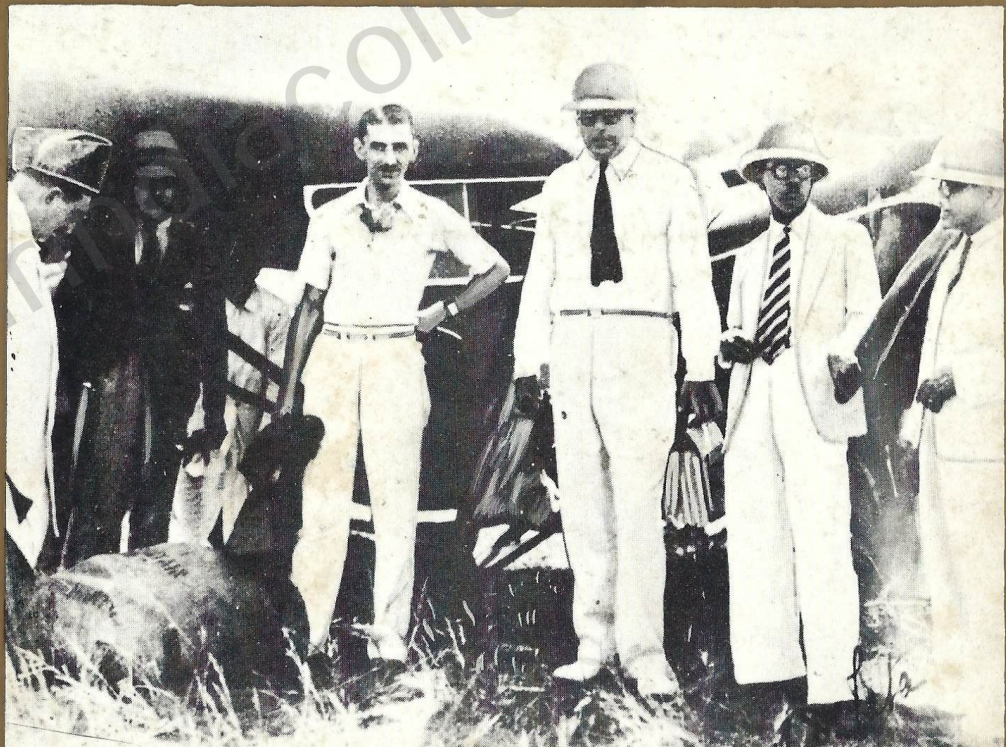
. . . and India's first scheduled air mail arrives.