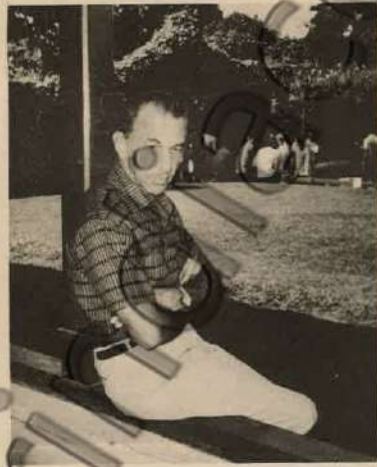
The Chairman in deep thought. You'd be too—in his place.

The ladies were smart. They came to eat - not play.