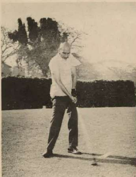
You can't blame the Air Marshal. At the end of 36 holes he realised he'd been using a Samurai sword.