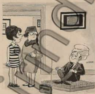
"He's listening to Air India".