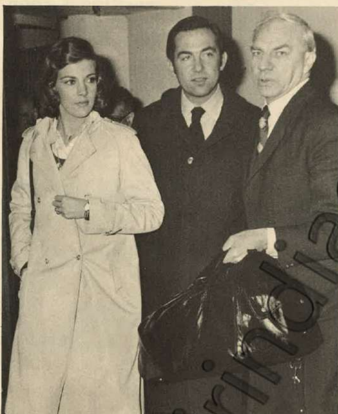
Ex-King Constantine of Greece and Queen Marie leaving our 747 on their arrival in London from India.