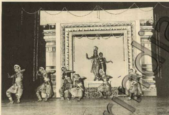
The large gathering of guests and Air-India staff assembled for the Modern School Annual Day watching the dance performance by the students at the Shanmukhananda Hall (L)