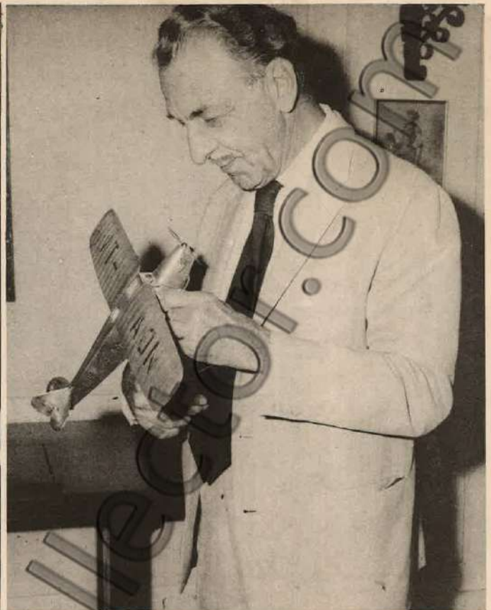
श्री जे. आर. डी. टाटा पुस्तोथ विमान के सिल्वर मॉडल के साथ। इस विमान से उन्होंने १५ अक्टूबर १९३२ को कराची से बम्बई तक की उड़ान की थी।

जैसे ही सरकार ने योजना की स्वीकृति दी एअर-इंडिया ने कम समय के नोटिस पर अंतरा-प्रांतीय संचालन आरम्भ कर दिया। १९५३ में राष्ट्रीयकरण होने पर एअर-इंडिया ने विभिन्न मार्गों व सेवाओं का विस्तार कर अपने पक्ष आगे फैलाए।