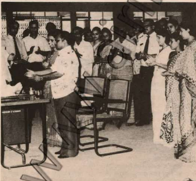
बम्बई एयरपोर्ट पर कार्गो कॉलेक्स के II मॉडल के उद्घाटन के लिए पूजा की गई।