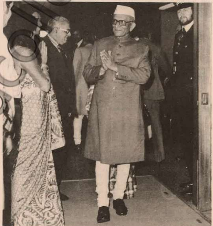
भारत के प्रधान मंत्री श्री मोरारजी देसाई, जिन्होंने एयर-इंडिया से लन्दन और न्यूयार्क की यात्रा की, लन्दन के हीथ्रो एयरपोर्ट पर एयर-इंडिया कर्मचारियों के साथ।