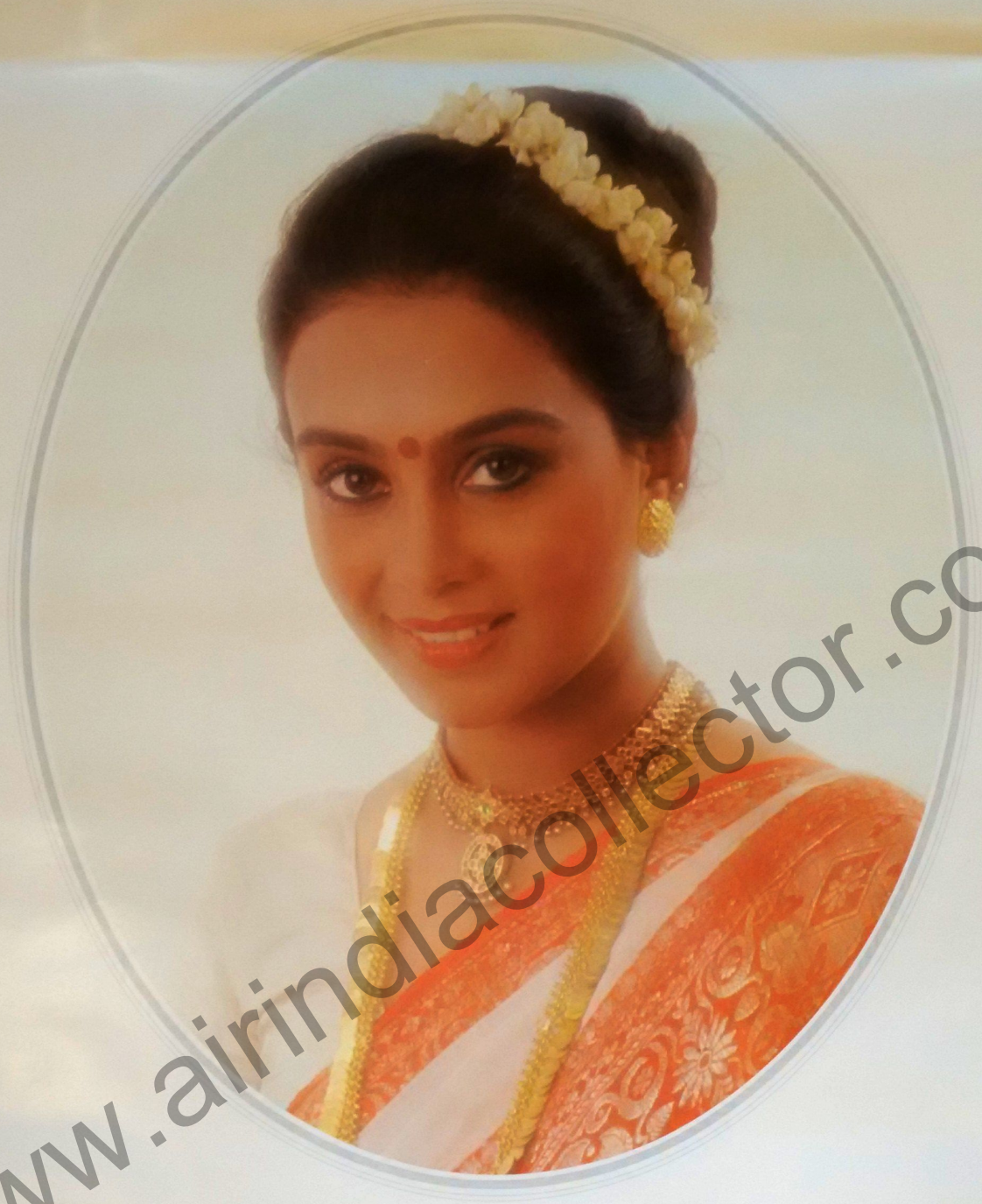
A Kerala Woman

Dusky, doe-eyed, the Nair girl wears a hand-woven cotton saree in white, with a red brocade border. The one-sided top knot, encircled with jasmine is distinctive, and worn on festive occasions. The intricately carved gold thodai in her ears are matched with the kasumala of gold sovereigns but offset with a gold collar, padikkam, inset with stones and pearl drops.