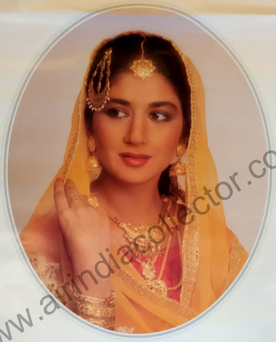
A Hyderabadi Woman

The shy, gentle look of the Hyderabadi Muslim girl is accentuated by her attire—a vermilion silk gharaikata, (full length gathered, divided skirt with a hip-length shirt) and a heavily hand-embroidered dupatta (veil), draped over the head to partly cover the face, when necessary. Gold jewellery, incorporating the peacock in its design, and the special Muslim hair ornament, the jhoonari, in the crescent moon design, completes the costume.