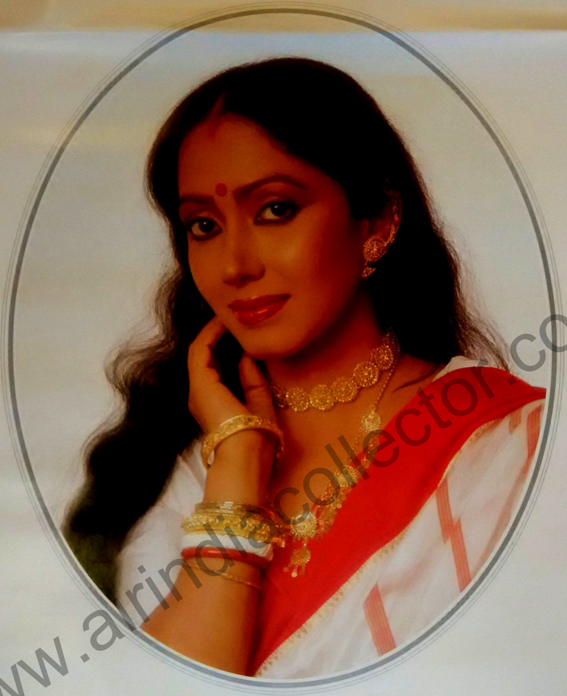
A Bengali Woman

The Bengali girl, her soft looks framed by her jet-black cascading hair, is dressed in the manner of an orthodox, older married woman. The white silk saree with the 'lalpara' or red border combination is repeated in the white blouse edged with a red frill neckline. Red-powdered sindoor in the hair signifies the married status. Heavy gold filigree jewellery, two necklaces, each shaped in floral medallion patterns and 'kaan' jhumka, bells suspended from earrings shaped to cover the ear, add femininity to the attire.