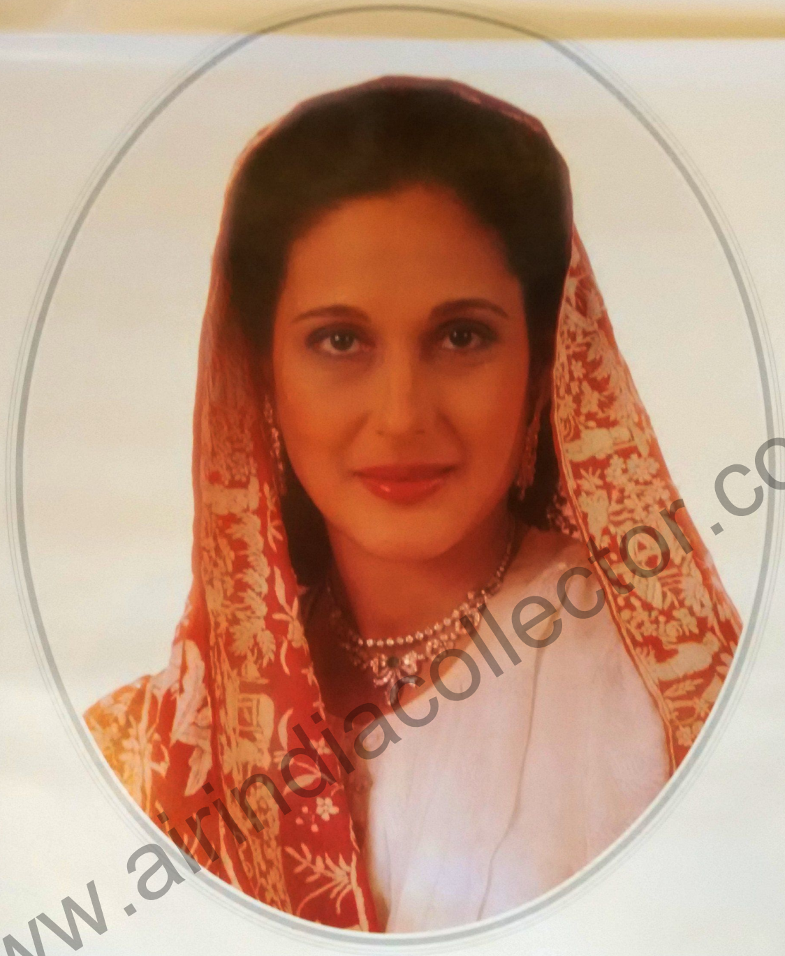
A Parsi Woman

Strong, sharp features, a throwback to her Persian ancestry, this Parsi girl of the Zoroastrian faith, is dressed in a '30s fashion style. During this period, due to trade links between Parsi entrepreneurs, China and the Western world, Parsi fashions are a curious and interesting blend of three cultures. The Chinese embroidered silk saris, reminiscent of hand-painted scrolls, are called gara, and are today family heirlooms. The diamond jewellery worn is also of the '30s and is Western in design.