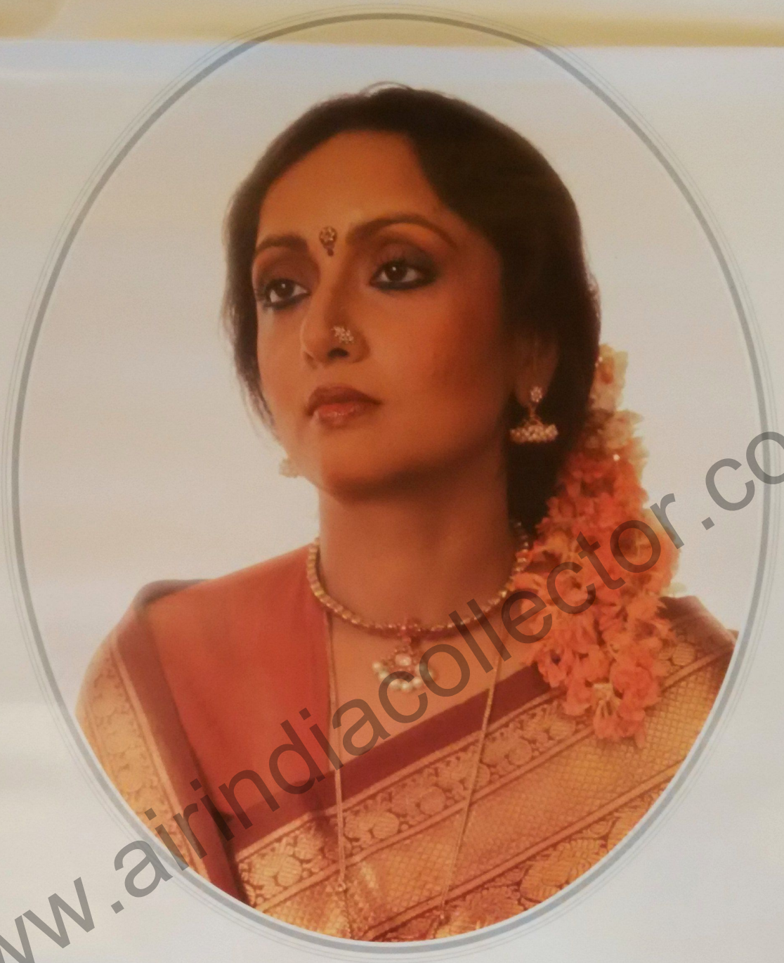
A Tamilian Woman

Her dark complexion offset by the richness of a handwoven silk Kanchipuram saree, the characteristic wide border of which depicts the peacock in golden weaves, orange kanakambaram and white mallipoov flowers in her hair, combined with traditional ornaments, bedeck this Tamilian girl. The jimbidi or bell shaped ear ornament is held also by a gold mantal (chain) which is hooked in the hair. The besan is worn in the nose, a sigappu kal addigai, red stone necklace encircles the neck, while the thali kodi in gold, a symbol of marriage hangs lower, almost hidden in the saree folds.