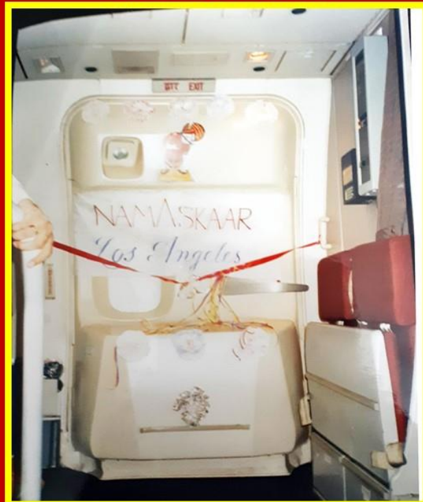
L-2 DOOR OF THE AIRCRAFT, DECORATED IN FLIGHT BY CABIN CREW FOR THE GRAND OPENING AT LA