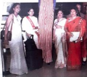
Uncle Sam stands tall and proud

The Air-India Counter was decorated with balloons and streamers. There were