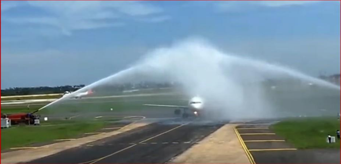
A WATER CANNON SALUTE SUCH AS THIS WAS ACCORDED TO OUR AIRCRAFT AS IT TAXIED TO ITS BAY.