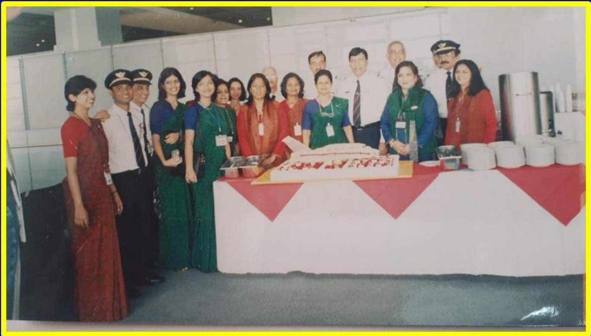
SEND OFF FROM FROM FRANKFURT AIRPORT