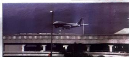
Air India's Konarak approaching LAX