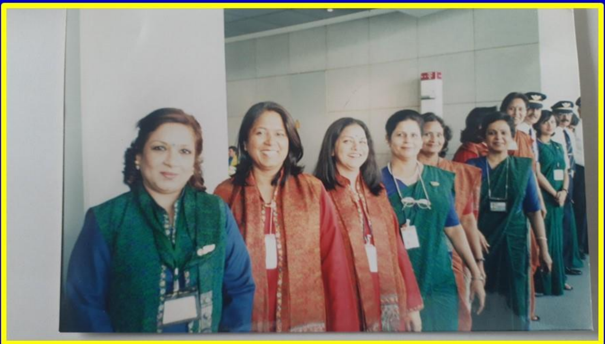
READY TO BOARD FROM FRANKFURT FOR DEPARTURE TO LOS ANGELES