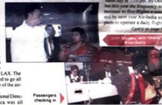
Passengers checking in