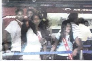
Passengers sporting Air India sashes