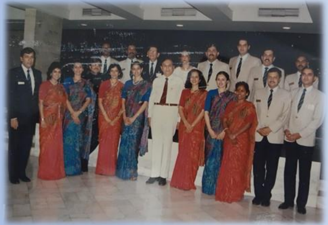
The new Red & Blue floral print saree uniform of the Air Hostesses was introduced on this flight