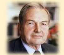
David Rockefeller Billionaire U.S.A.