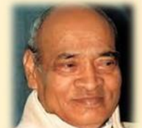
P.V.Narasimha Rao Fmr. P.M. India