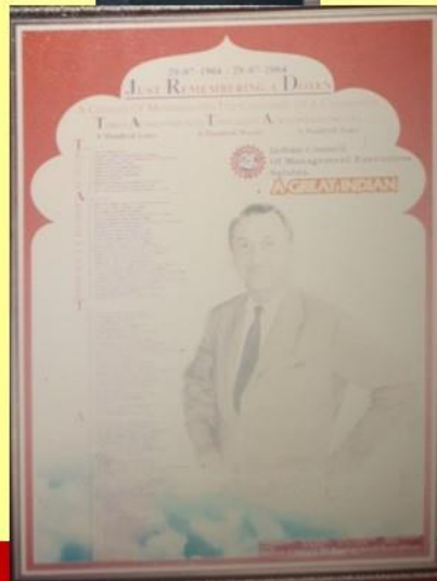
Special Memento I created for the Centenary