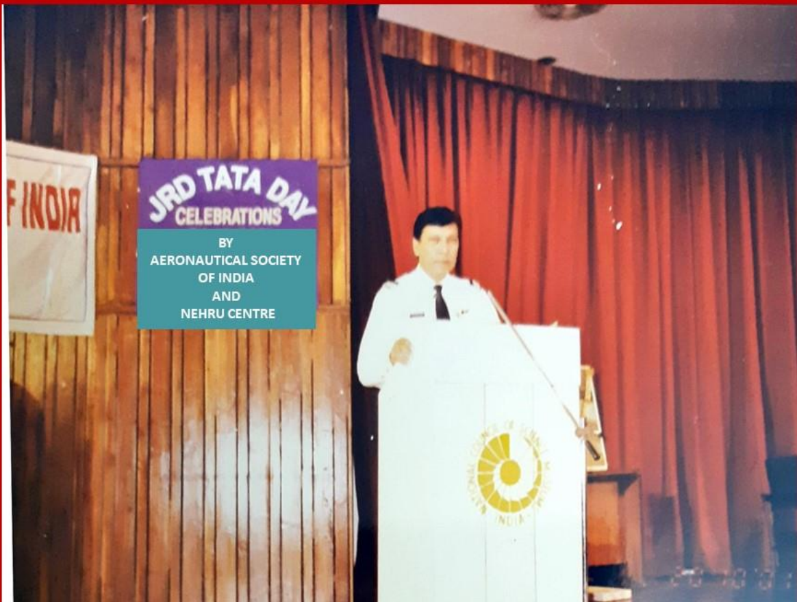
Giving a Presentation on JRD at the JRD Celebrations organized by the Aeronautical Society of India and Nehru Centre.