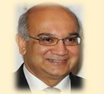
Keith Vaz M.P. U.K.