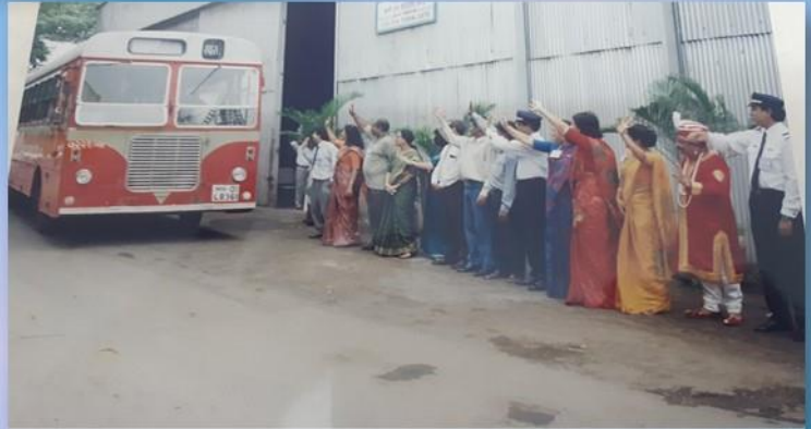
Bidding Good Bye to all the Special Children who left in the BEST BUS