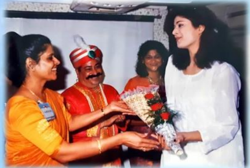
FLORAL FELICITATION FOR THE CHIEF GUEST