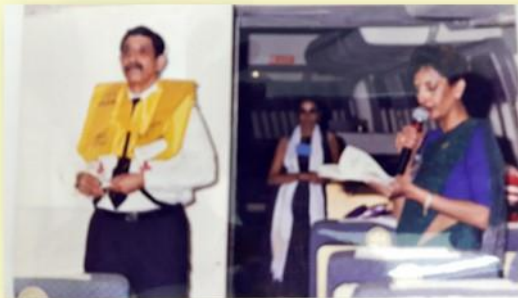
PRE-FLIGHT ANNOUNCEMENTS AND FLIGHT SAFETY DEMONSTRATIONS