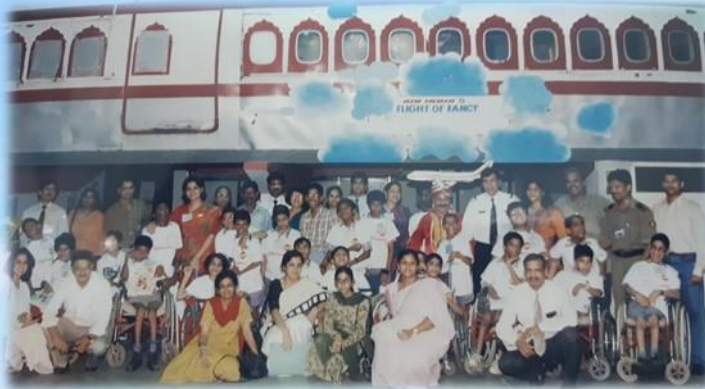
OUR SPECIAL PASSENGERS UNDER OUR SPECIAL AIRCRAFT AFTER OUR SPECIAL FLIGHT