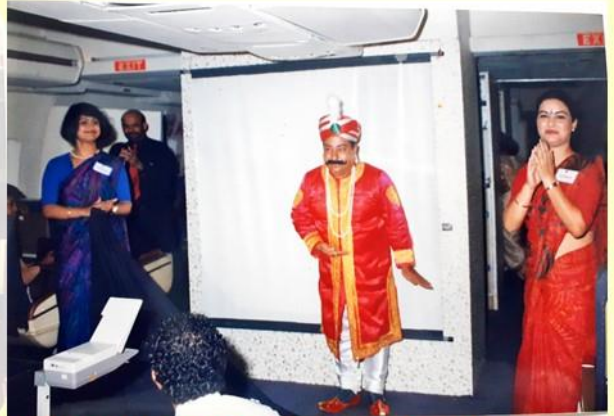
MAGICAL TRANSFORMATION OF A MAHARAJAH STATUE TO A REAL LIFE MAHARAJAH