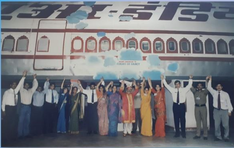
The AIR-INDIA 'FLIGHT OF FANCY' TEAM exulting after the flight landed successfully