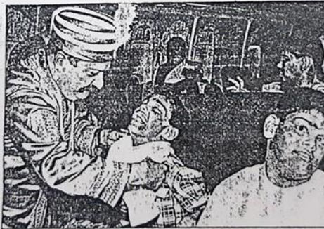
Air India's Maharajah Mascot helps a spastic child try on a T-Shirt at the airlines' "Flight of Fancy," organized in a replica Boeing 747 at the Santa Cruz Airport in Mumbai.

The program called the "Flight of Fancy" was arranged by Air India in association with the Spastic society of India, a volun-